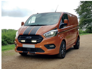
FORD TRANSIT CUSTOM 2018+