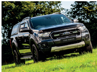
FORD RANGER 2019+

Thank you for choosing a Lazer Lamps product. Vielen Dank dafür, dass Sie sich für ein Produkt von Lazer Lamps entschieden haben. Merci pour choisir un produit de Lazer Lamps. Gracias por la seleccion de productos de Lazer Lamps.