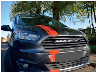
FORD TRANSIT COURIER 2014+