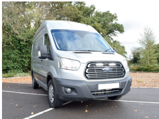
FORD TRANSIT 2017+